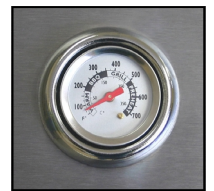
Large stainless steel thermometer