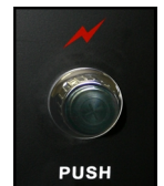
Continuous spark for reliable lighting