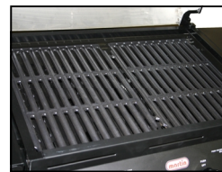
Heavy-duty coated cast iron grids