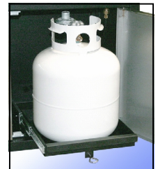
Practical sliding tank tray

665-300 MG1860 70" wide x 26" deep x 50.5" high 270 lbs 320-160 Long grill cover, quality material with Velcro 665-160 Deluxe rotisserie kit with 120 V. SS motor