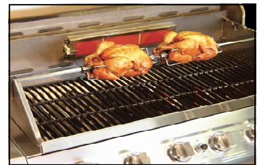
Infrared rear burner